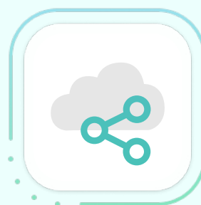
CONNECTIVITY & COMMUNICATION